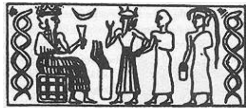
"The Serpent Lord Enthroned." From Gampbell (1964, p. 11).

The pillars of Jenken and Boaz are exactly 23 cubits high, each, and the right post has a DNA strand wrapping around it. DNA is even found in several renderings that are thousands of years old. 3